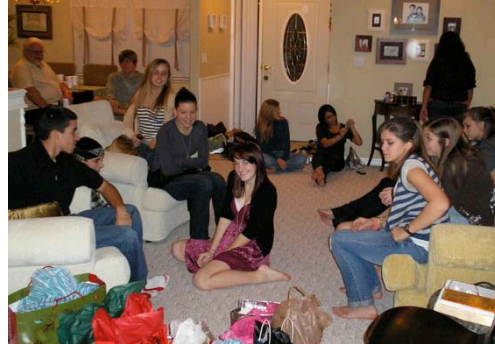
Gaither HS holds a leadership meeting celebrating Christmas together.

Our Legacy Clubs have been finishing the school year strong with various projects. At Carrollwood Day School, the members painted ceramic mugs for all the teachers and presented them on the last day of school. It is acts like these that shows the love of our Lord to the world. At all our schools December ends with exams and final club meetings. We have had a great start with great excitement for the upcoming year. As the world appears chaotic, these students remain focused on sharing their faith and growing in Christ.