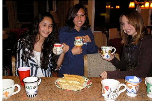
CDS students hand painted ceramic mugs for all their teachers.

Our Legacy Clubs have been finishing the school year strong with various projects. At Carrollwood Day School, the members painted ceramic mugs for all the teachers and presented them on the last day of school. It is acts like these that shows the love of our Lord to the world. At all our schools December ends with exams and final club meetings. We have had a great start with great excitement for the upcoming year. As the world appears chaotic, these students remain focused on sharing their faith and growing in Christ.