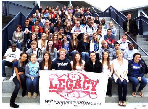
Fellowship: Wharton HS Legacy Club meet for their yearly yearbook photo.