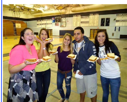
Service: Some of Gaither's leaders prepared peanut butter and jelly sandwiches for their football and girls basketball teams before practice.