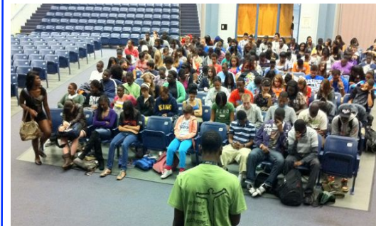
Outreach: King Legacy has grown from 40 students to 140 attending their meetings.