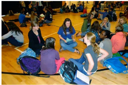
Discipleship: Students at Steinbrenner HS form small groups to share their thoughts and faith.