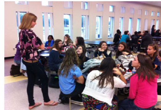
Students at Wharton HS Legacy formed small groups according to grade and our leaders led.

Close in prayer: Invite students to pray to become people of these qualities and to look forward to the day they will become citizens of heaven.