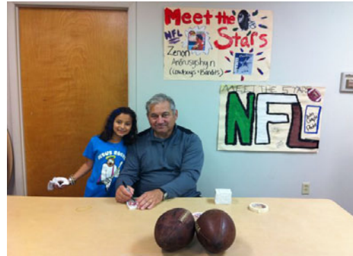
Signing autographs at Tampa Christian Academy Homecoming Day. A great day with great kids!