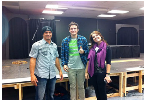
Members of Grow Life Church Youth Ministry have been helping Legacy Clubs. They have ministered at Gaither, Wiregrass Ranch, Land O Lakes HS. and J. Long MS. (Gaither HS below)

We thank God for the last three years of ministry with Zenon Ministries. We received faith that He was going to direct us to a needed mission field that needed Jesus Christ greatly. The opportunities to serve God in so many ways and totally rely on His provisions through his followers has increased our trust and commitment. This generation of youth is different than the previous one. Technology is so available that we think it normal today for our youth to be texting, studying, listening to music and carrying on a conversation with their parents all at the same time. How will all this impact the future of ministry and spirituality? The studies done recently paint a bleak picture for our youth and those raised in church. This makes our mission even more important as we are the only ministry in many of our schools. Every month more than 2000 students gather in outreach meetings, Bible studies, service projects, prayer and fellowship. "But thanks be to God that, though you used to be slaves to sin, you have come to obey from your heart the pattern of teaching that has now claimed your allegiance." Romans 6:17